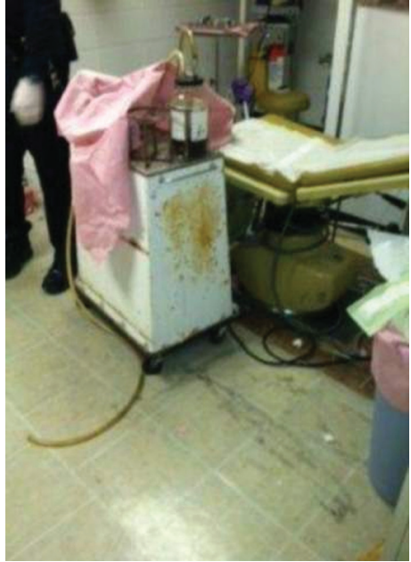
These filthy conditions were found at a Muskegon, Michigan abortion clinic on December 26, 2012. Conditions like this are common and indefensible by the abortion cartel.