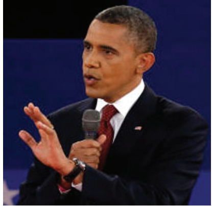
Obama doubled-down on abortion in 2012

Why that has happened, especially after the convincing victories of pro-life candidates in the 2010 mid-term elections, is a matter open for debate. It is our position that the facts show one major cause for the Election Day defection was because the pro-abortion side was allowed to frame the debate on “wedge” issues such as contraception and rape. Pro-life supporters took the bait, and flooded to the field of battle on ground that was not of